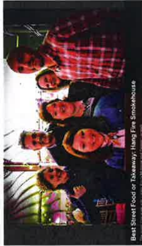
The Winners of the Food & Farming Awards 2015 The winners receive their prized cropping boards at a ceremony in Caege Green. Blas! 8/10

Food Cardiff is working to secure the future of Bessemer Rd Wholesale market Meeting with Deputy Minister for food and farming